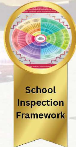
School Inspection Framework