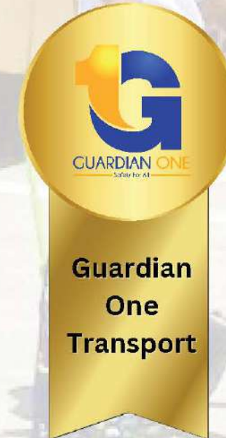
Guardian One Transport