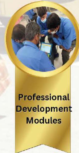
Professional Development Modules