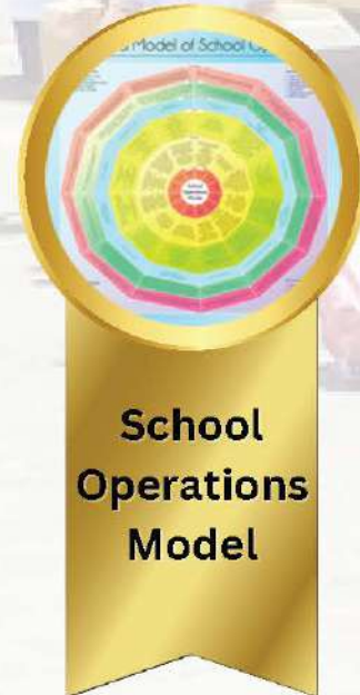
School Operations Model