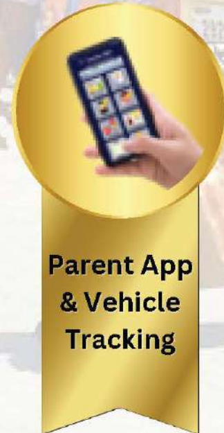
Parent App & Vehicle Tracking