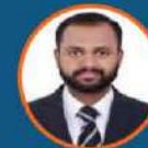
Jayas George Bright Riders School