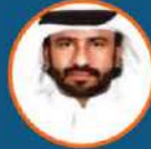
Ahmad Abbas Alblooshi National PRO